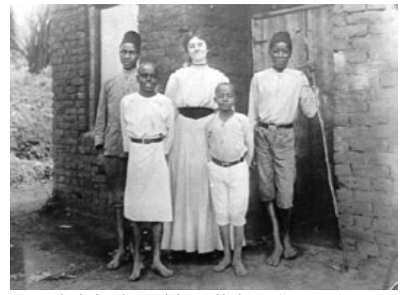
"a native family" (Kenya):