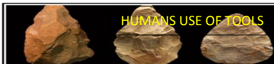
HUMANS USE OF TOOLS