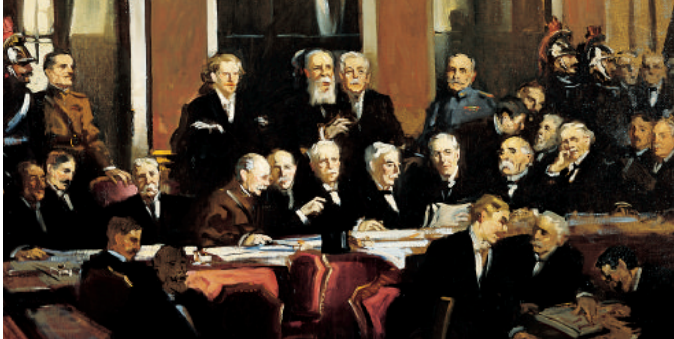
▲ In this painting of the Paris peace talks, American president Woodrow Wilson (second row, center right) shows British leader Lloyd George a report. French premier Georges Clemenceau sits on Wilson's other side.

almost 10 million people, as well as the incredible destruction caused by the war, undermined the whole idea of progress. Entire populations had participated in a devastating slaughter.